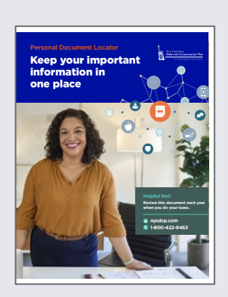
Access the Personal Document Locator here.

By keeping your beneficiaries up to date and keeping important information and documents in a place family members can locate, you can help make things easier for your loved ones. NYSDCP has a new tool to help make this process easier — our Personal Document Locator.