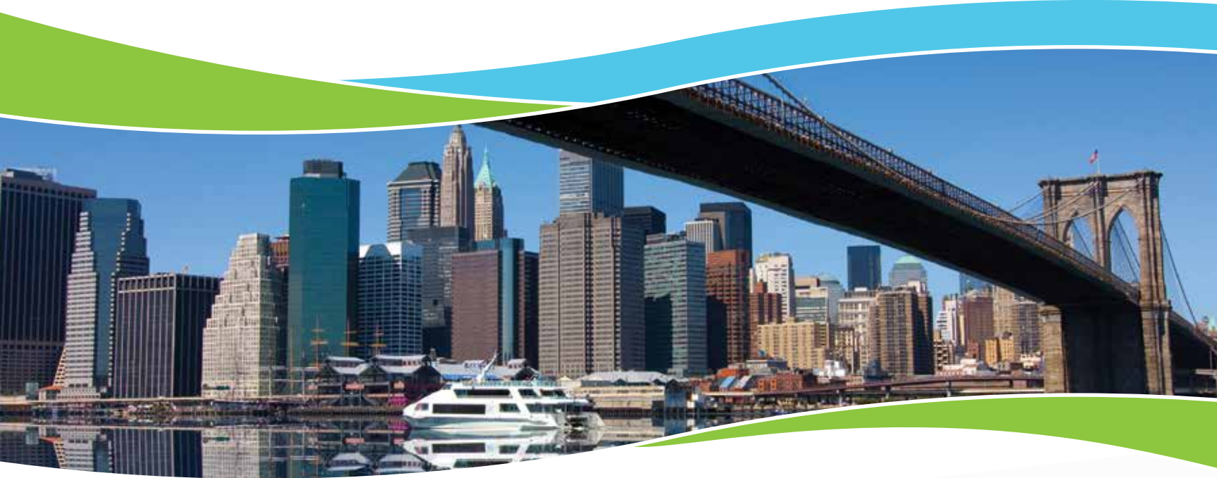
Brooklyn Bridge and Manhattan, New York