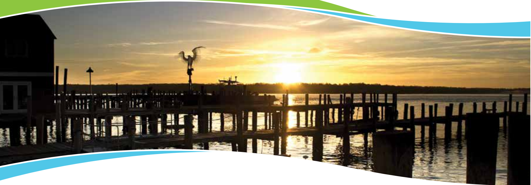
Mitchell Marina of Greenport Village, New York