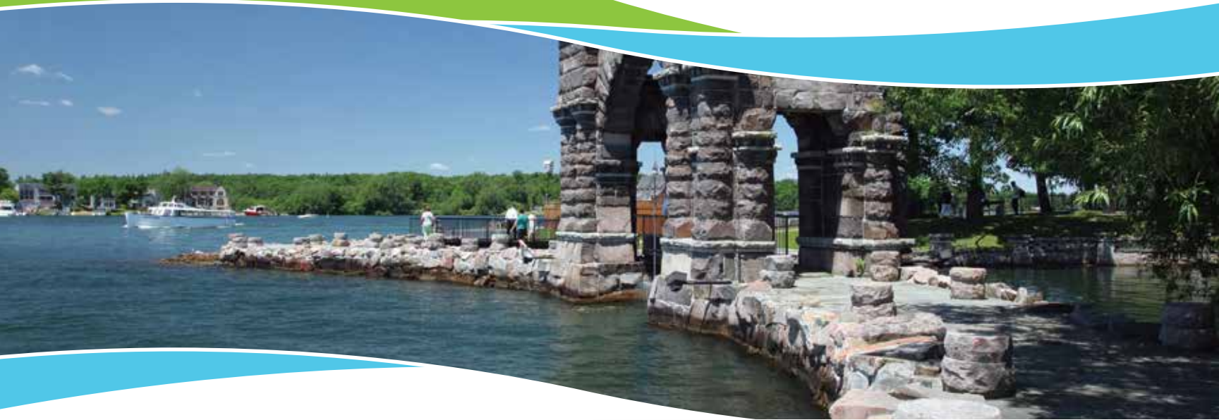
Boldt Island Arch, New York